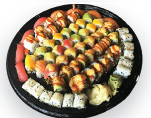
Small Variety Platter

CALIFORNIA TUNA AVOCADO* SALMON AVOCADO* SWEET POTATO TEMPURA SPICY SALMON* 🔥 SPICY TUNA* 🔥