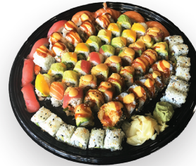
Small Variety Platter

Small: (3) Classic Rolls, (5) Deluxe Rolls, (8) Nigiri Large: (6) Classic Rolls, (10) Deluxe Rolls, (16) Nigiri